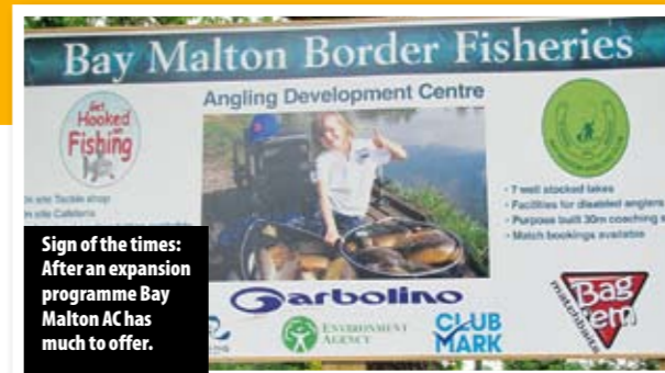
Sign of the times: After an expansion programme Bay Malton AC has much to offer.

It was a wonderful day at a wonderful venue, a huge credit to the Bay Malton AC. And the company was brilliant - every BMAC member I walked past uttered a welcoming word of some kind - it's that sort of venue, and it's that sort of club. I'd advise you join - you won't regret it!